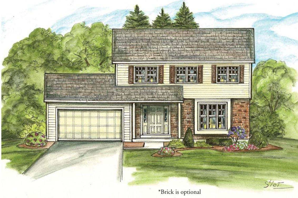
*Brick is optional